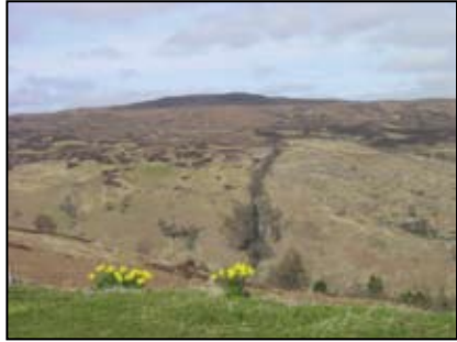
Little Loch Broom area, Scotland

HIGHLAND HILL WALKING. Intrepid hill walkers will enjoy this excursion across the Highlands Scotland and Donegal. Our trip begins in Edinburgh where we meet with our partners at Wilderness Scotland, who specialize in treks across the Scottish Highlands. After five days in Scotland, we head to northwest Ireland for hill walking in Donegal. One highlight of the Irish adventure is trekking overland to One Man's Pass on Sliabh Laeg, the highest sea cliffs in Europe. Tour size is limited to ten participants.