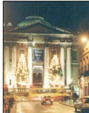
Dublin City Hall, Christmas

Christmas in Ireland: December 1-10, 2008 Application Deadline: Oct. 20, 2008. Cost: From $4290.