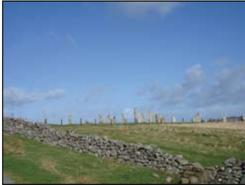
Ring of Callanish